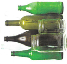
Empty Glass Bottles (food jars, beverage)