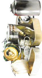
Empty Metal and Aerosol Food Cans (aluminum, tin, foil, NO caps)