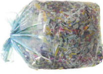
Shredded Paper (tied shut in a clear plastic bag)