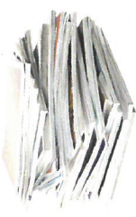
Magazines and Phone Books (catalogs, soft cover books)