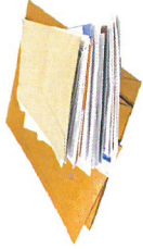
Mail and Greeting Cards (junk mail, envelopes)