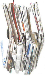
Newspaper (all sections, inserts)