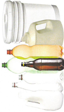
Empty Plastic Containers (#1-#7, 5-gallon pails, NO caps)