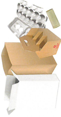
Boxboard (dry-food boxes, paper bags, egg cartons, cores)