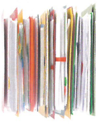
File Folders and Office Paper (all colors)