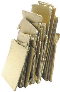
Corrugated Cardboard (wavy center layer)